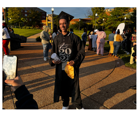
Ashton - Sumner High School

In 2024, we celebrated the achievements of our graduating seniors, each completing a remarkable journey of growth, learning, and leadership. Through their participation in My 180 Youth Program, these students gained valuable skills and discovered the power of their potential.