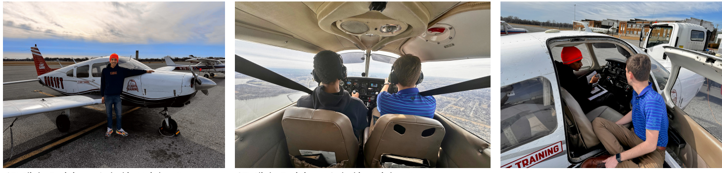
STL Flight Training - Cahokia Heights, IL